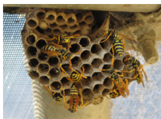
Paper wasp nest

Yellowjackets don't usually sting when they are looking for food—unless their nest is disturbed by a direct blow or the wasps inside detect vibrations. Mowing the lawn near an underground nest, construction work near a nest in a wall void, or even walking near a nest can provoke an attack by one or more yellowjackets. This is especially true if the nest has been disturbed before.